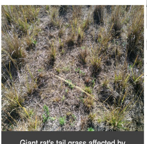
Giant rat's tail grass affected by crown rot, Mareeba: July 2017

Visit our website for more information and please like us on facebook